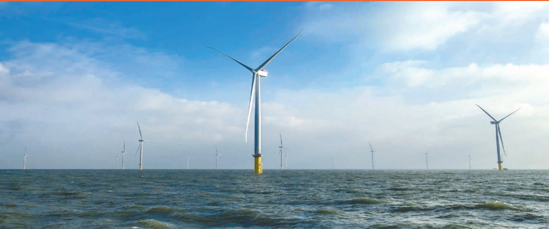
London Array Offshore Wind Farm, Thames Estuary. For illustration only.