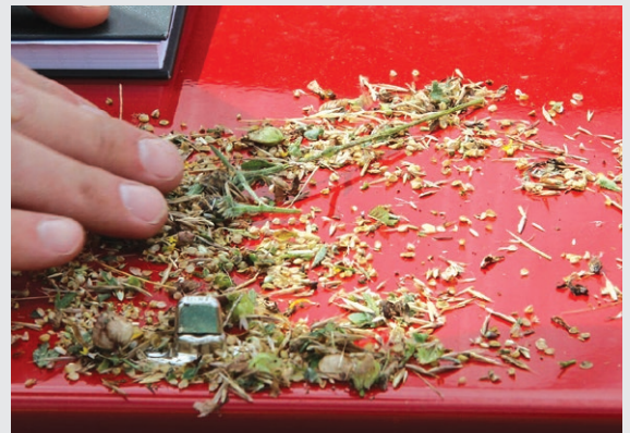
Chalk grassland seed, including quaking grass, upright brome, yellow rattle and buttercup.