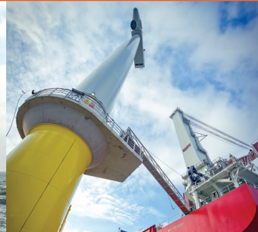
Final turbine installation, London Array, Thames Estuary.

Welcome to our fifth newsletter, with the exciting news that the Secretary of State for Energy and Climate Change granted consent for Rampion on 16 July.