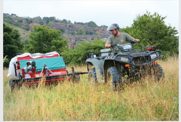
Brush harvesting seen in the South Downs.

Kew is collecting the seed, which will be tested and stored at their Millennium Seed Bank. Once the cable works are finished, the seed will be sown and the sites monitored, to make sure the restoration plan is effective. Any leftover seed will be donated to Kew and used in their charitable work across the UK. We're all very excited about working with such a well known organisation and we'll keep you up to date with the progress in future newsletters.